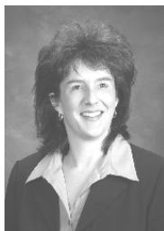
Rep. Jackie Walorski

State Representative Jackie Walorski continues to take a lead role in calling for an investigation of Planned Parenthood of Indiana to determine if child sexual abuse is being properly reported. As part of her call for action, Walorski is also asking the Indiana Family and Social Services Administration (FSSA) to freeze all Medicaid (taxpayer) reimbursements to Planned Parenthood pending the outcome of a thorough investigation.